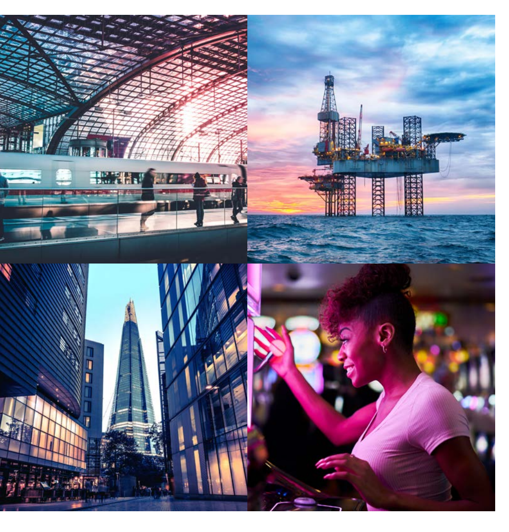
Protecting what matters, where it matters most

Synectics is a leader in advanced security and surveillance systems that help protect people, property, communities, and assets around the world.